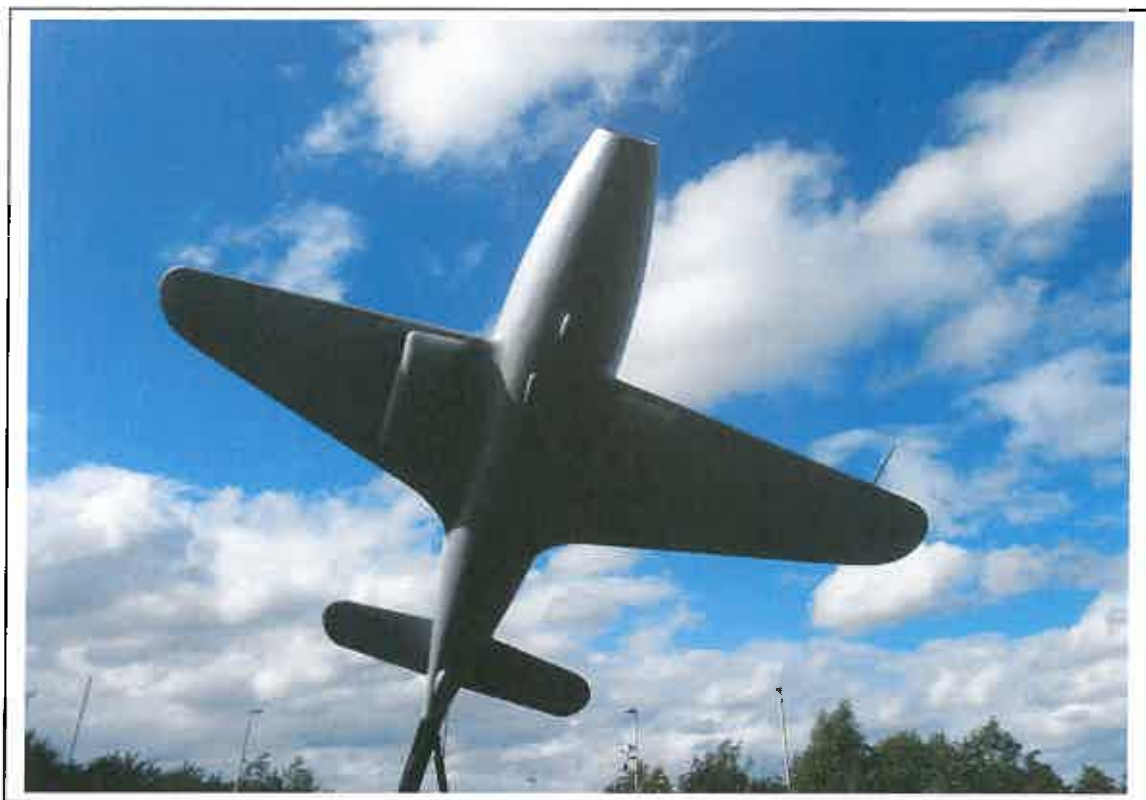
3. General view