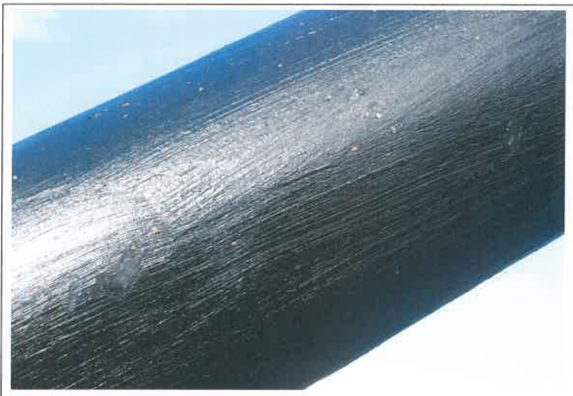
22. General view