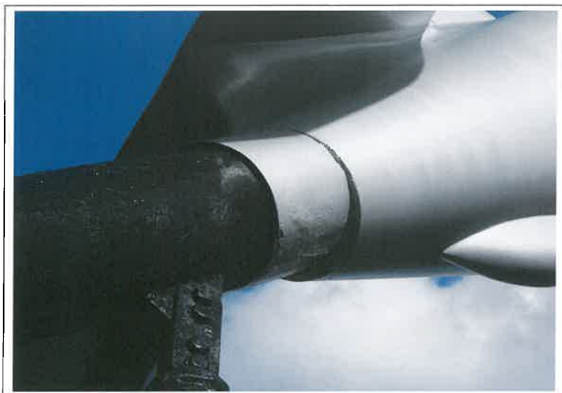
17. General view