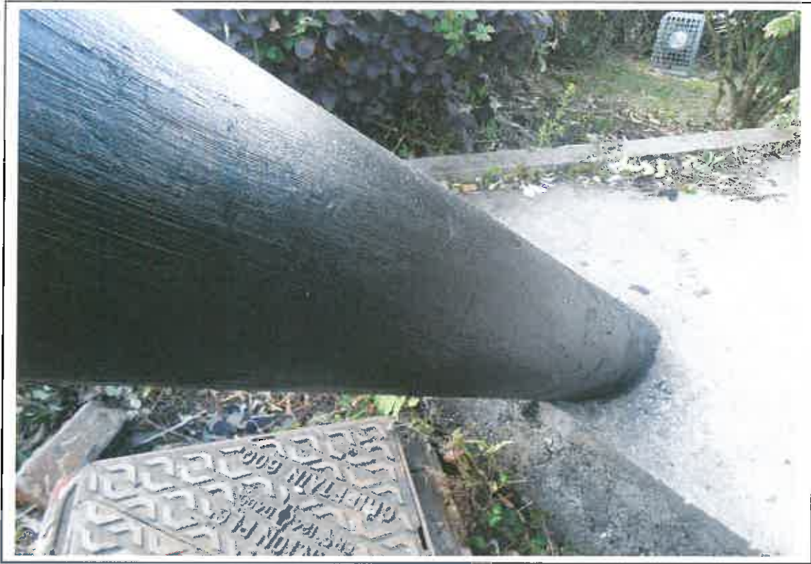
21. General view