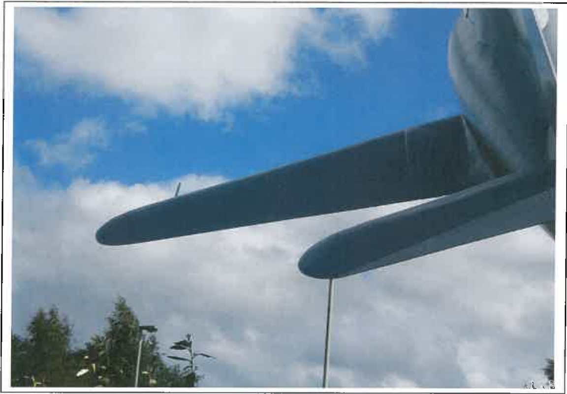
9. General view