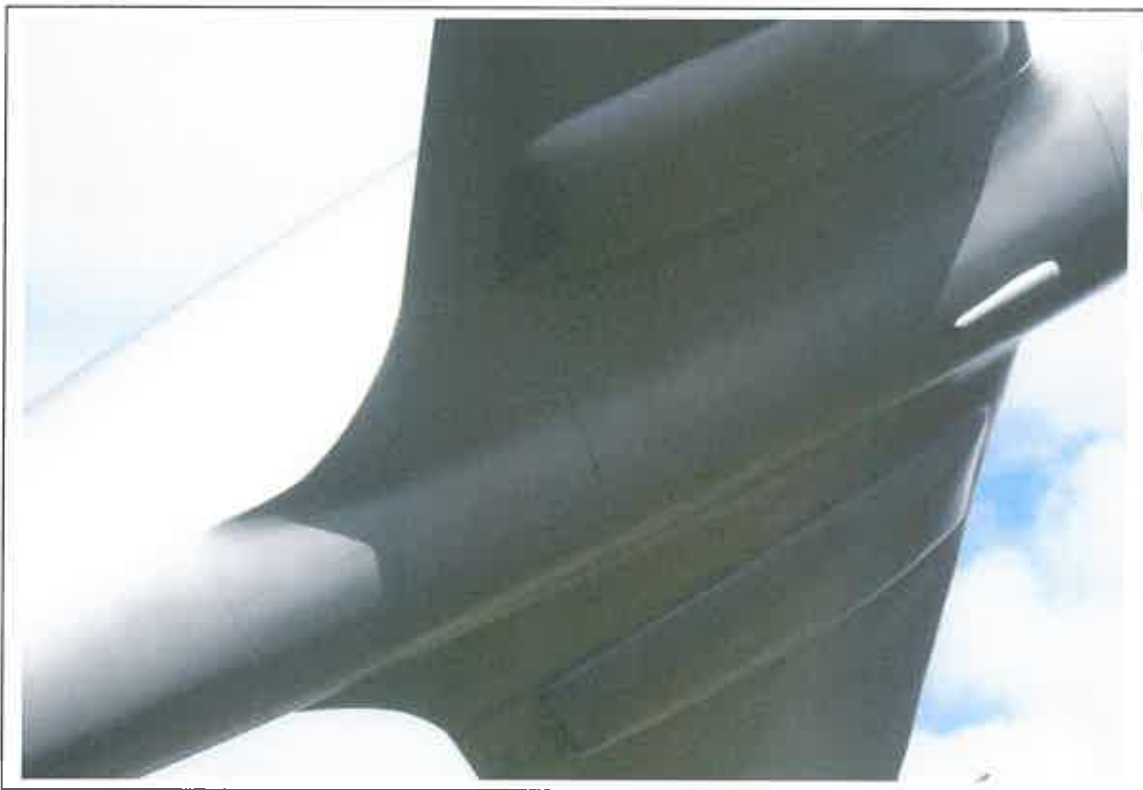
6. General view