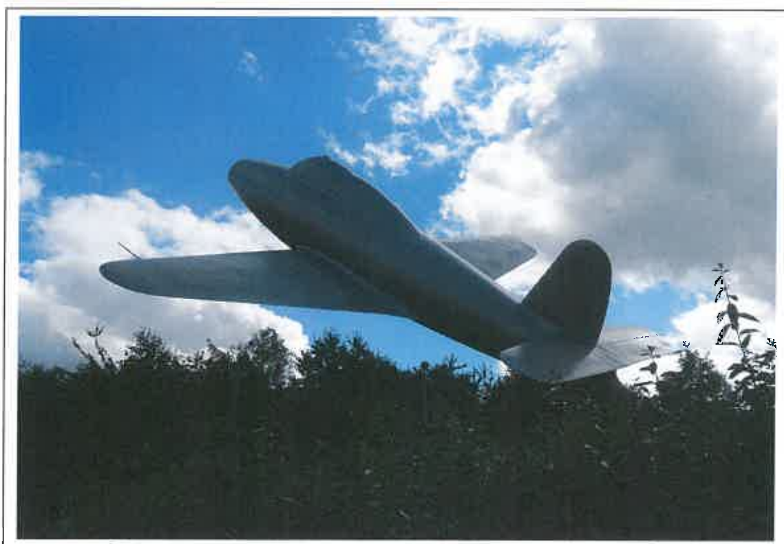
12. General view