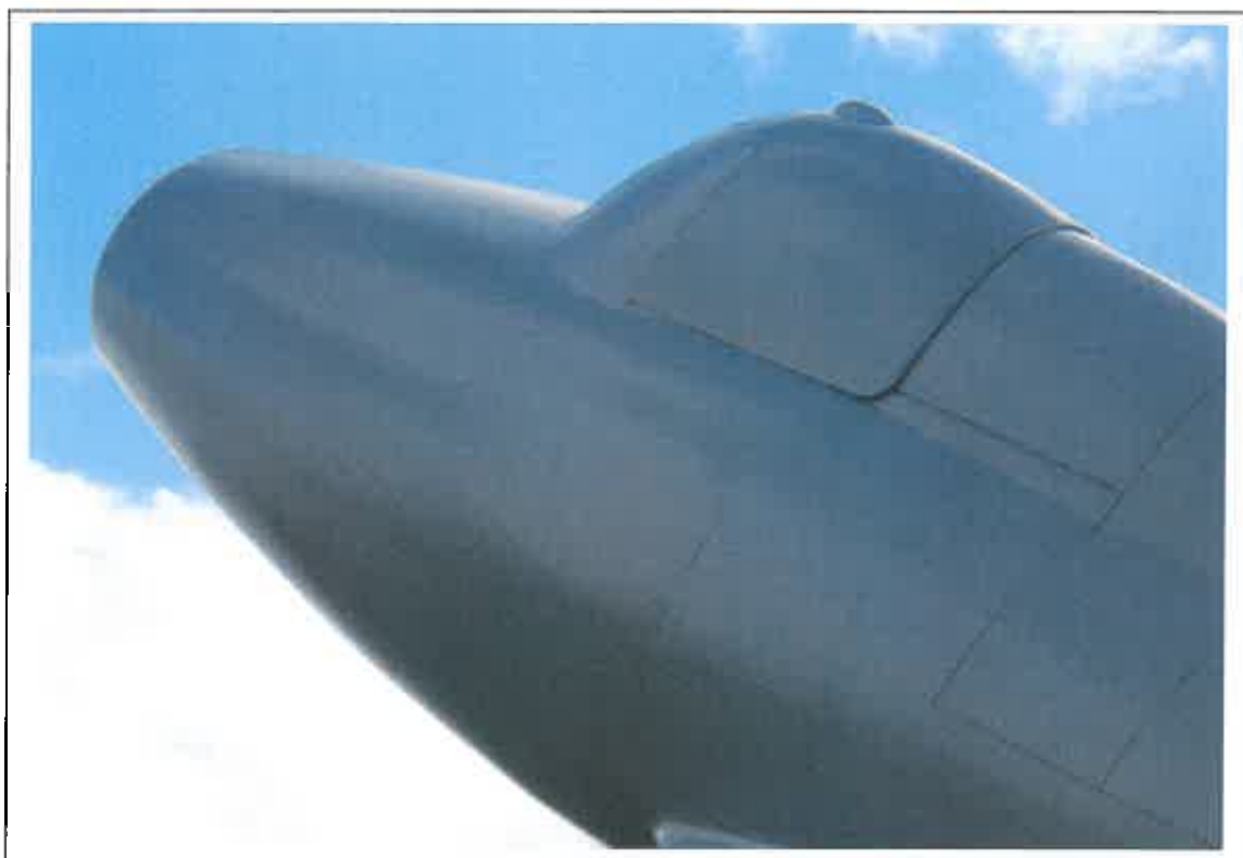
14. General view