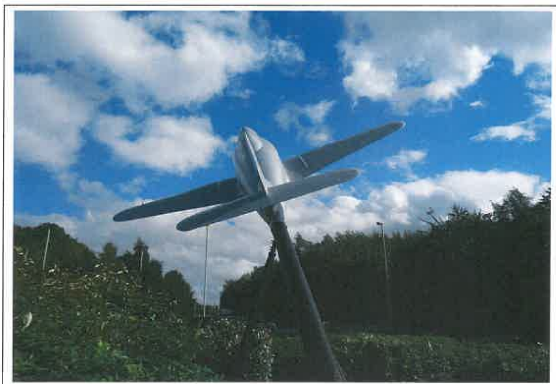
8. General view