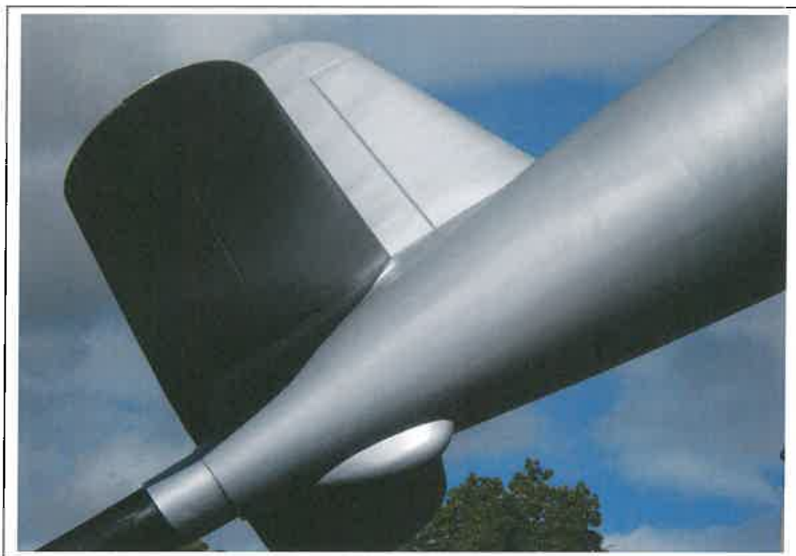
7. General view