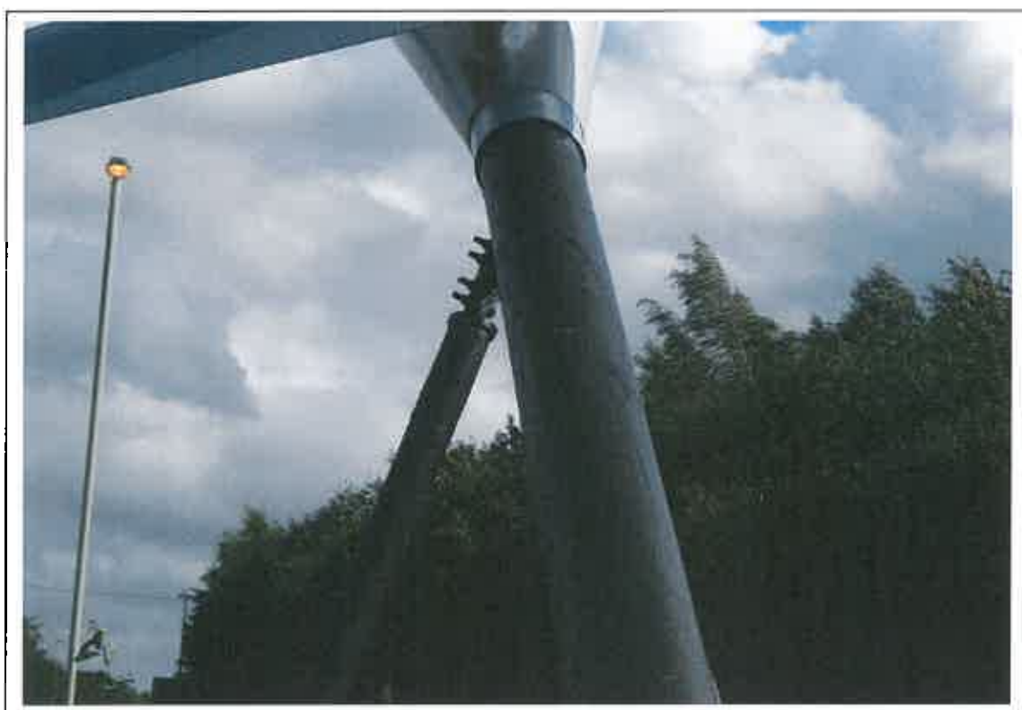
18. General view