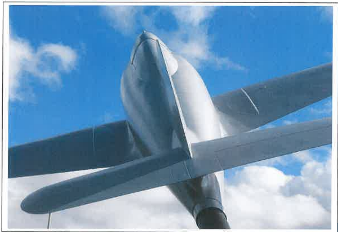
10. General view