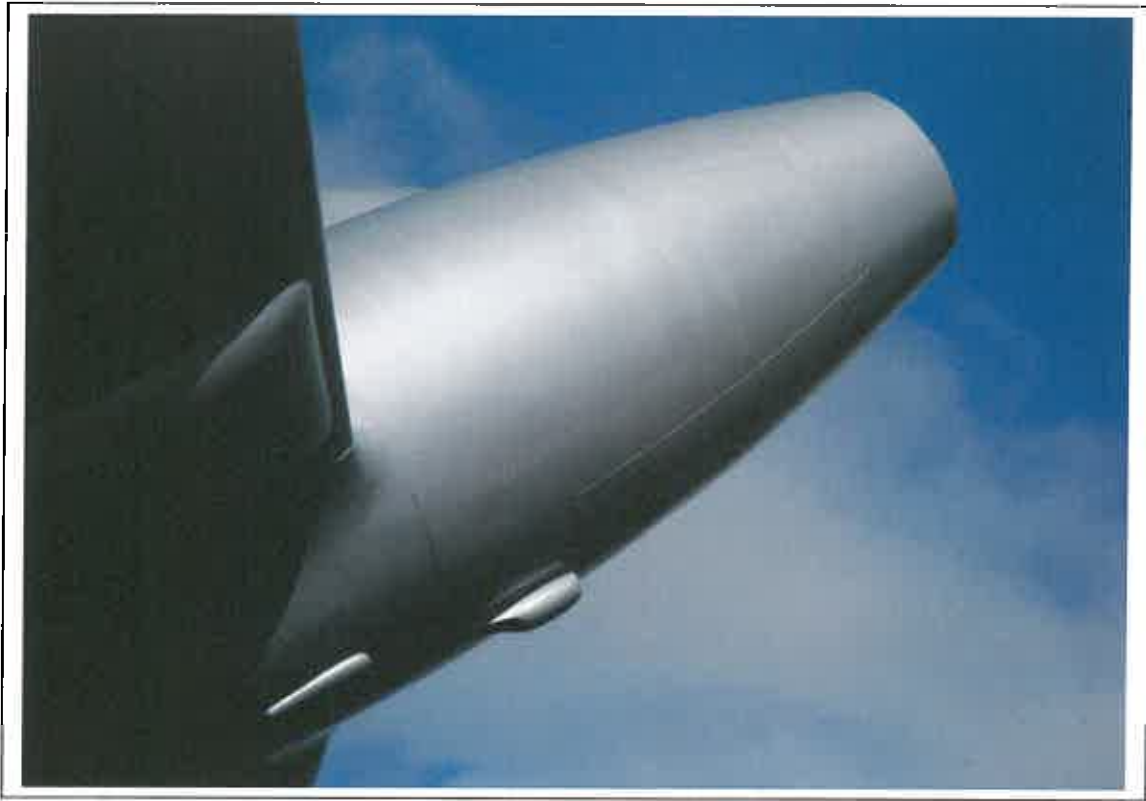
5. General view