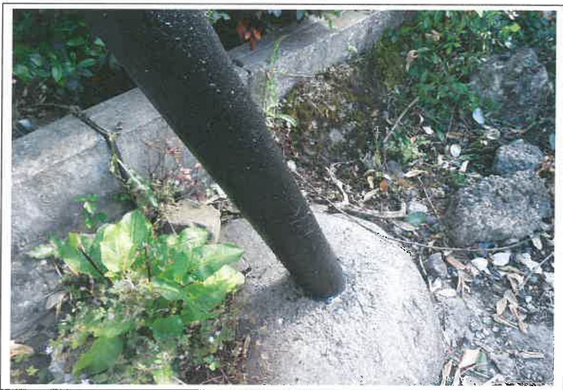
20. General view