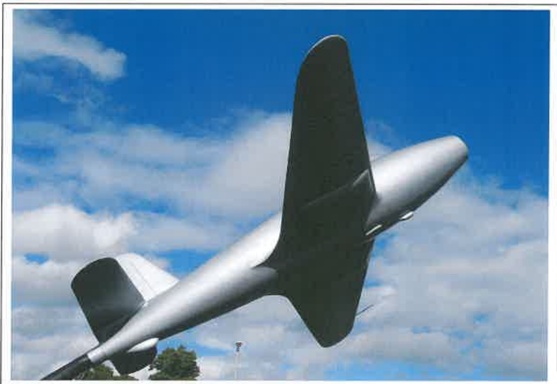
2. General view