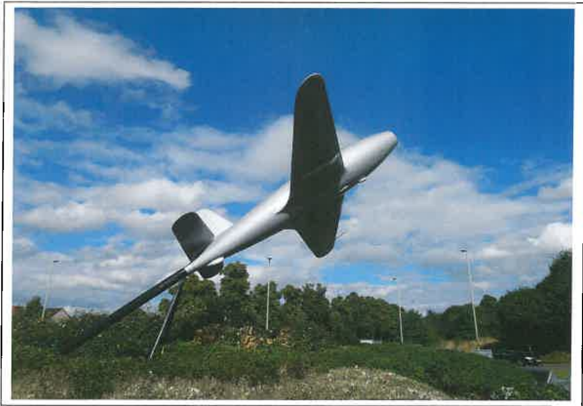
1. General view