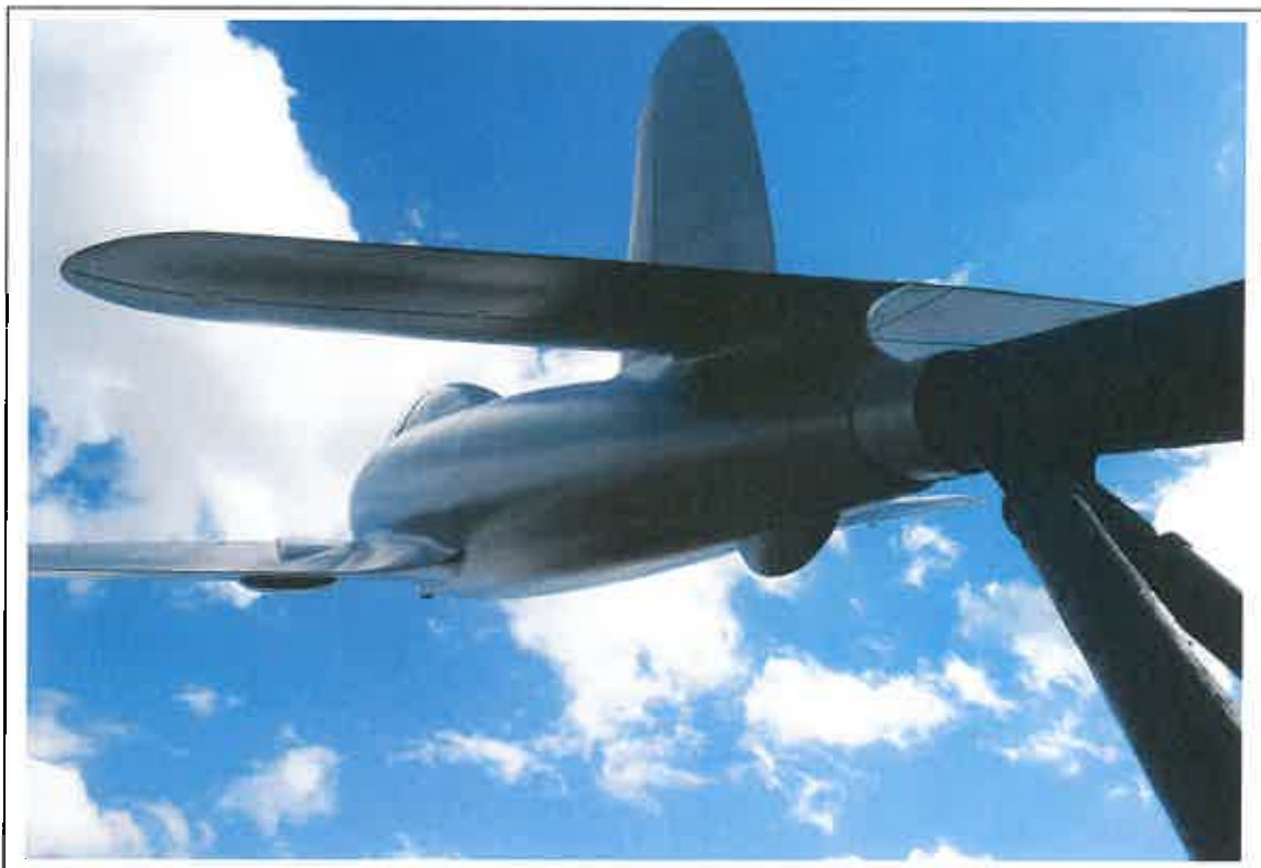
16. General view