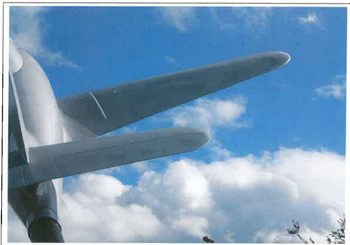
11. General view