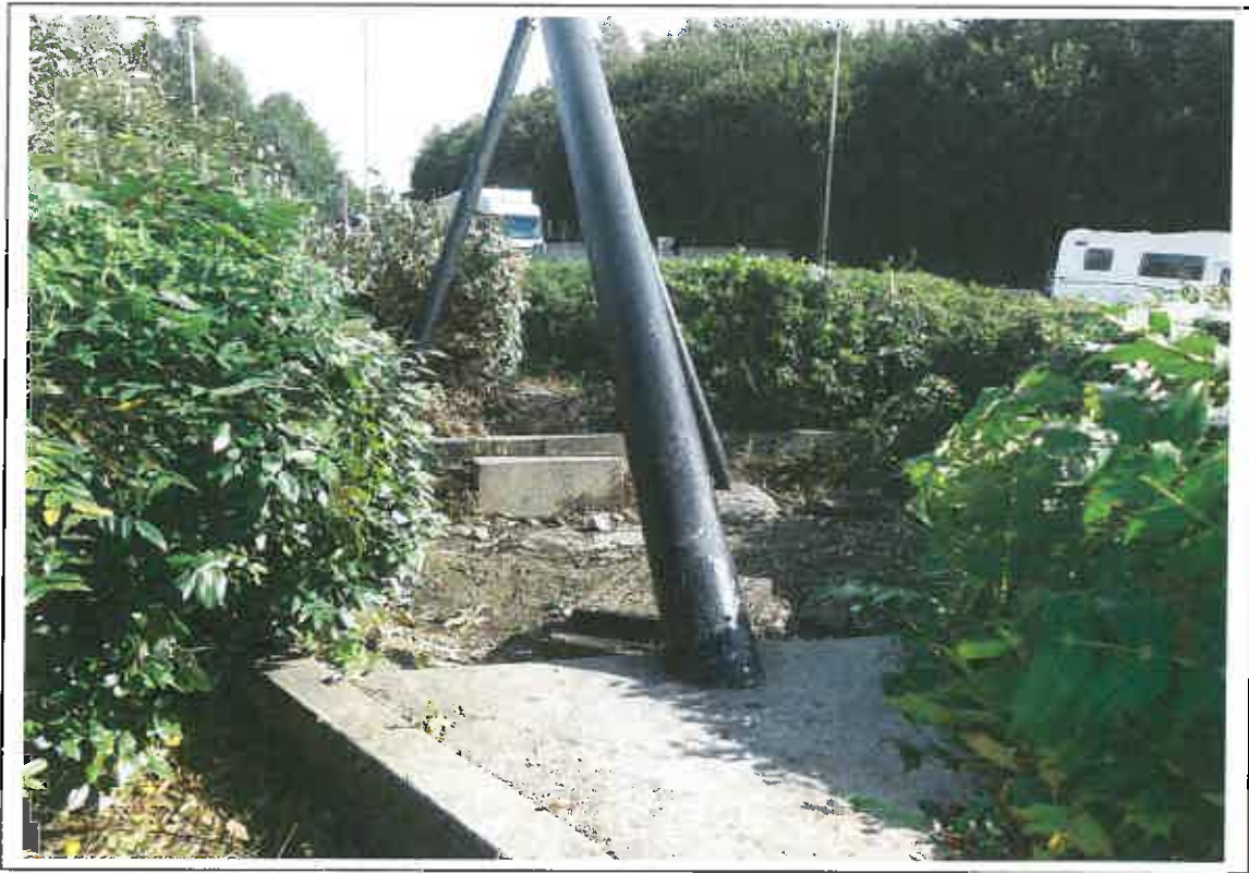
19. General view