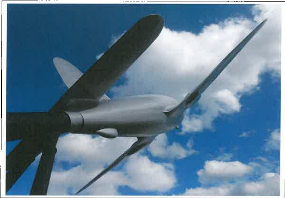
15. General view