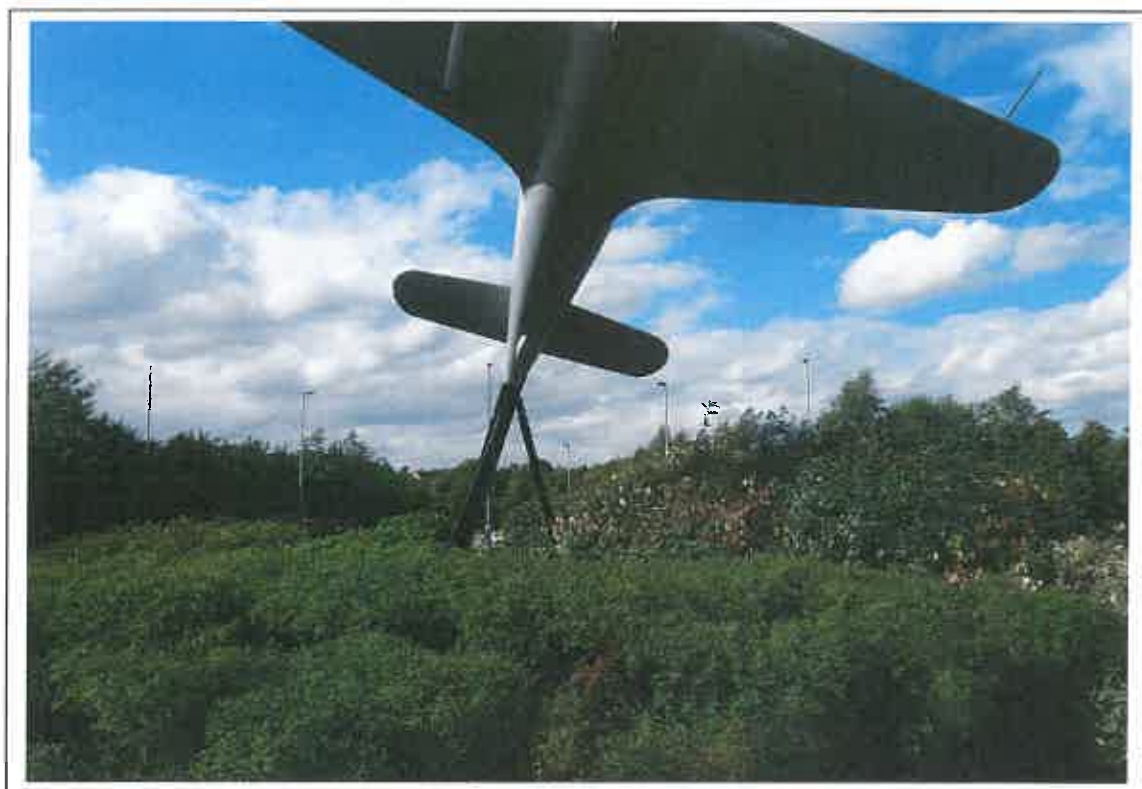
4. General view