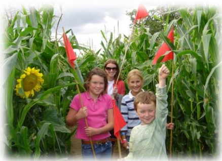
Promoting tourism across the district