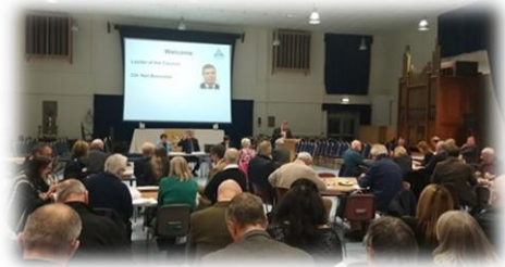
Continually reviewing activities