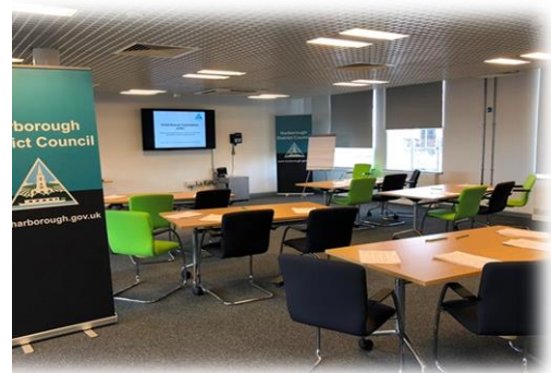
Harborough District Council's headquarters