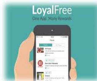
Launched the LoyalFree App