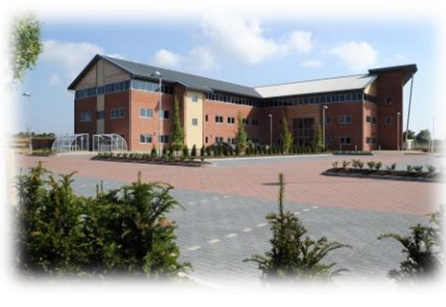
Supporting small and medium sized businesses