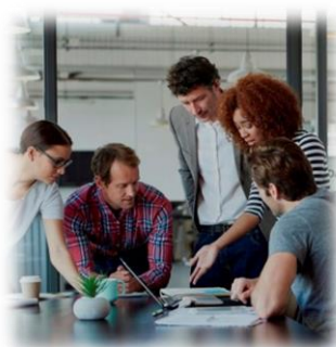
Supporting neighbourhood planning