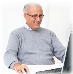
Providing online services for our customers