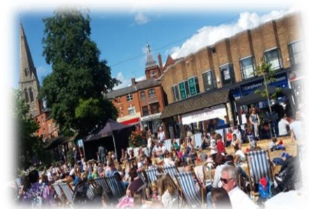
Organising community events