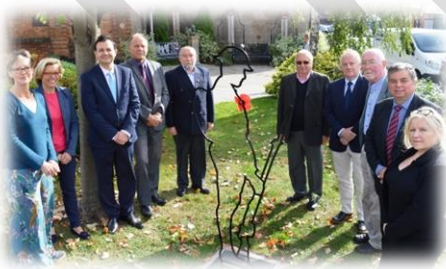
Marking the centenary of WWI