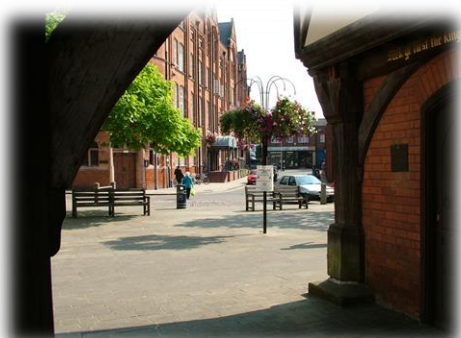
Harborough District Council