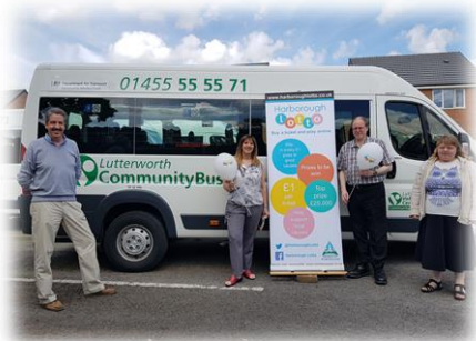
Supporting community initiatives