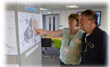
Managing future development